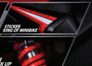
REAR SHOCK UP